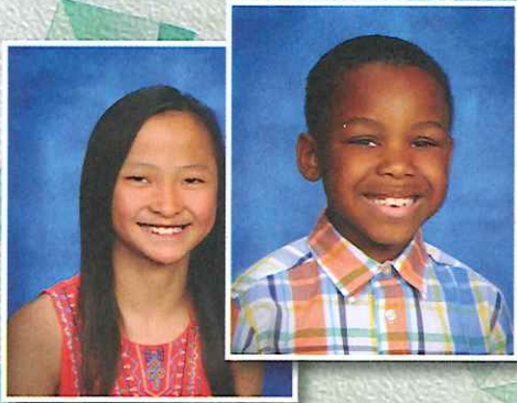
Traditional Pose Pose Tradicional