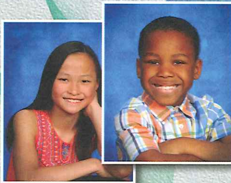
Optional Pose (Only available in packs 1 & 2) (Sólo disponible en paquetes 1 y 2)